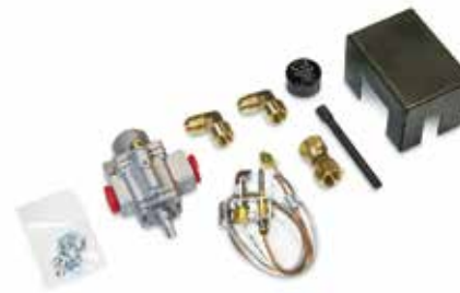
142K BTU Rating Item # HCSPK-LP or HCSPK-N