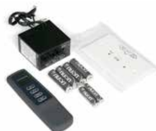
85K BTU Rating Item # GCRK