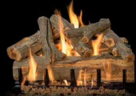
2-Burner Arizona Juniper 24"