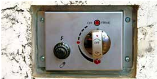
Easy Use Controls - Flame control & igniter