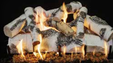
Shown: Quaking Aspen 30"