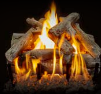
2-Burner Arizona Western Driftwood 18"

Arizona Western Driftwood (WD) Available in 18", 21", 24", 30", 36" and 42". Front View and See-Through. Burner compatibility 2 and 3 burner.