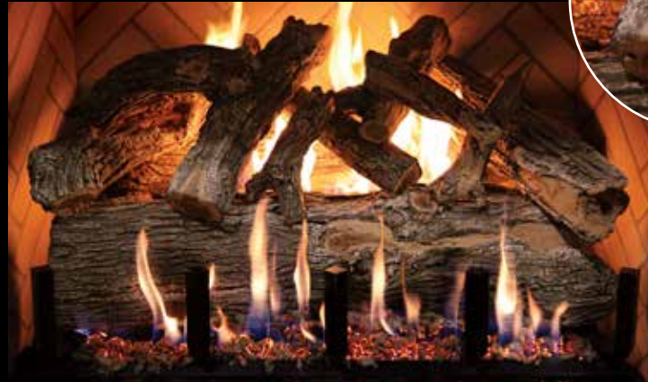
Jumbo-Burner - Jumbo Arizona Weathered Oak 36"