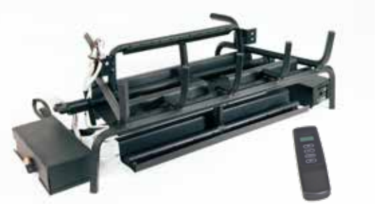
Assembled burner propane with battery electronic and remote system. 3BRN-##-***-MVKEI-GCRK