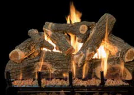
Shown: Arizona Weathered Oak 30"