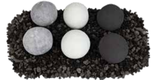
4" Cannon Balls Box of 8 Black, Dark Gray or Silver Item- CB4-8-##