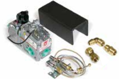
82K Natural Gas BTU Rating 110K Propane BTU Rating Item # MVQMKL or MVQMN