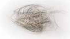
1 Gram Item # GLW-1