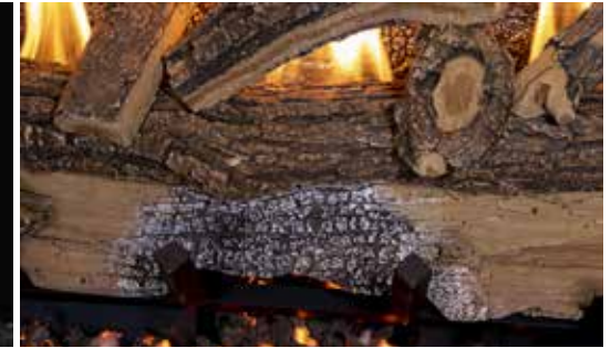
Realistic hand-painted charred logs