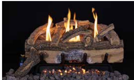
24" Split Oak Gas Logs