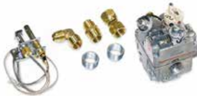
240K Natural Gas BTU Rating 320K Propane BTU Rating Item # HCMVQMKL or HCMVQMN