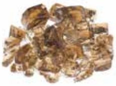
Terra Copper Item # RFG-10-TC