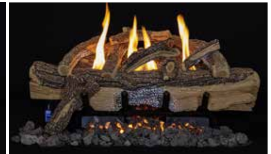
30" Split Oak Gas Logs