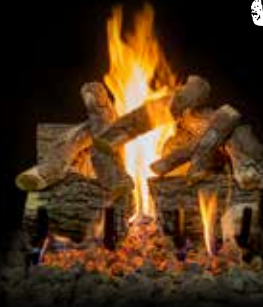
2-Burner Arizona Weathered Oak Charred 18"

Arizona Weathered Oak Charred (AWOC) Available in 18", 24", 30", 36" and 42". Front View and See-Through. Burner compatibility 2 and 3 burner.