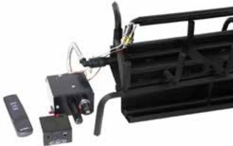
Assembled burner natural gas with modulating millivolt and remote system. 3BRN-##-***-MMVR