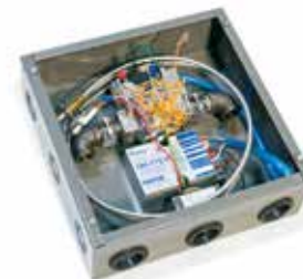
200K Natural Gas BTU Rating 320K Propane BTU Rating Item # EIS, EIS-LP, EIS-10 or EIS -LP-10