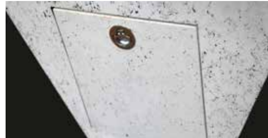
Easy Access Propane Tank Door (24" Propane Table)