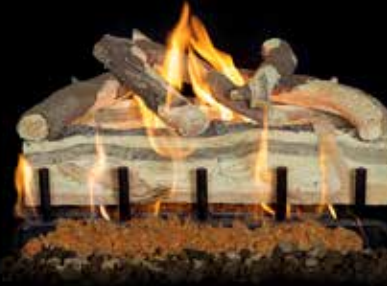
2-Burner Blue Pine Split 24"