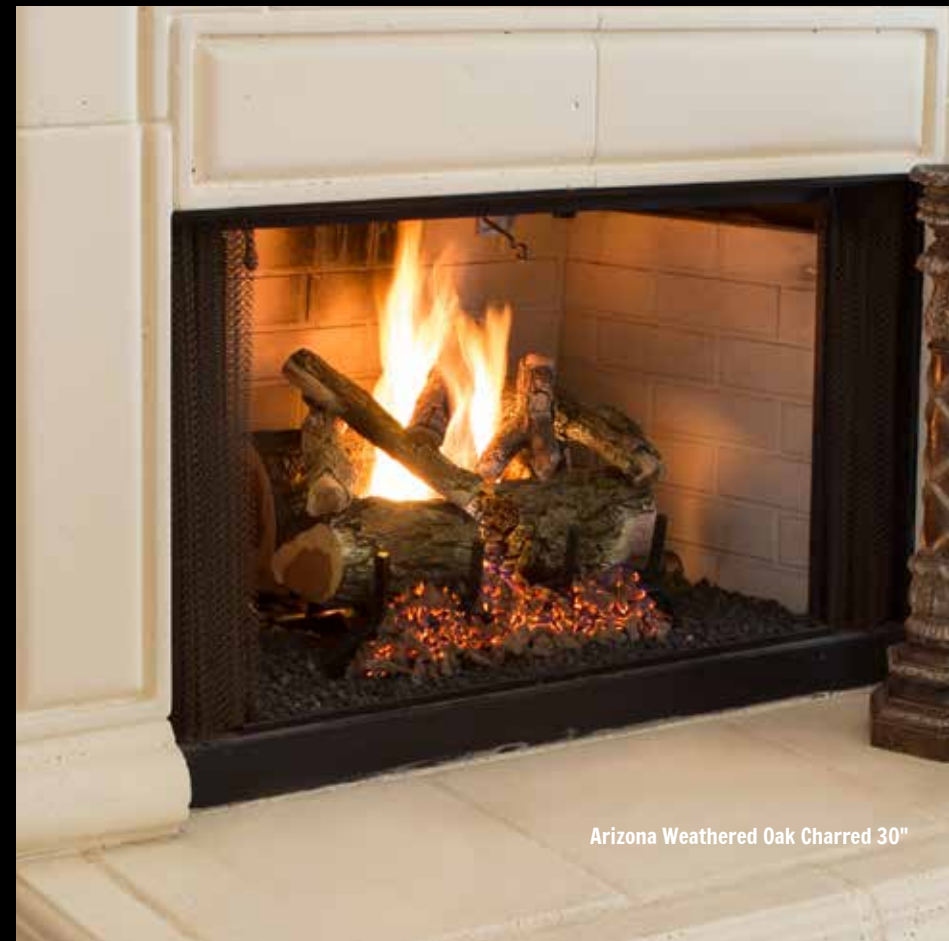
Arizona Weathered Oak Charred 30"