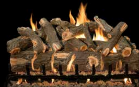
3-Burner Arizona Weathered Oak 42"