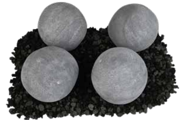
6" Cannon Balls Box of 4 - Black, Dark Gray or Silver Item- CB6-4-##