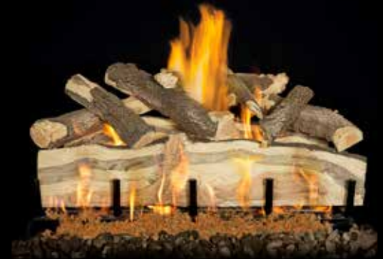
2-Burner Blue Pine Split 30"