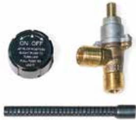
90K BTU Rating Item # MA