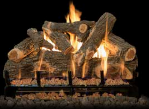
3-Burner Arizona Weathered Oak 30"