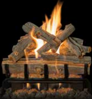
3-Burner Arizona Juniper 21"