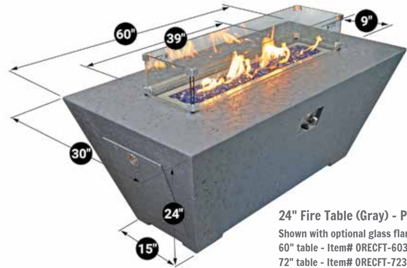
24" Fire Table (Gray) - Propane Shown with optional glass flame windguard 60" table - Item# ORECFT-603024-###-LP 72" table - Item# ORECFT-723024-###-LP

The rectangular table comes in 24" (Propane) height and features a 36" linear drop-in burner, Hot Surface Electronic Ignition & available in 5 stunning unique colors. For the media add one of seven unique 1/2" Reflective glass colors, Lava Rock, Tumbled Lava Stones, Arizona Weathered Oak or Western Driftwood fire pit logs