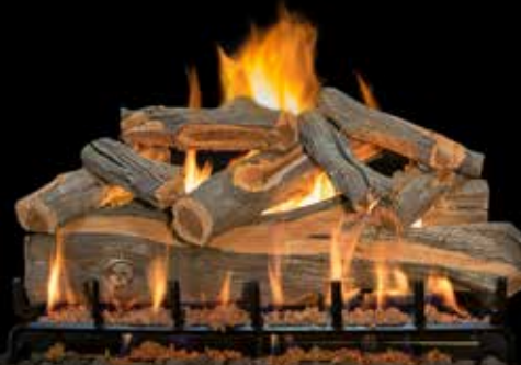
3-Burner Arizona Juniper 36"