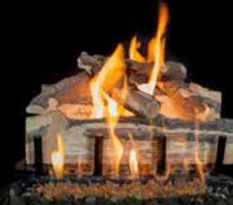
2-Burner Blue Pine Split 18"

Blue Pine Split (BPS) Available in 18", 24" and 30". Front View only. Burner compatibility 2 and 3 burner.