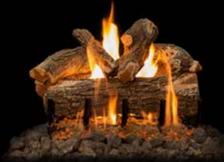
2-Burner Arizona Weathered Oak 21"