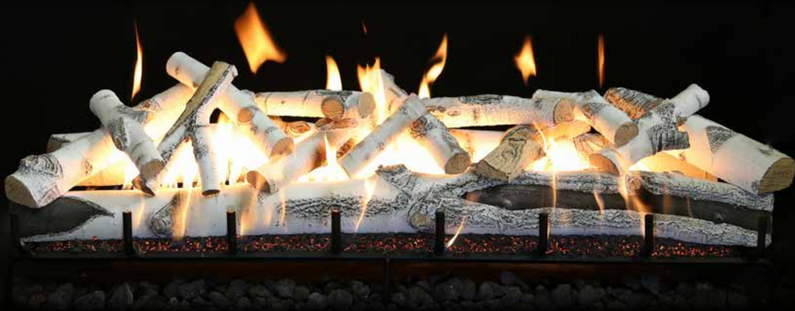
2-Burner Quaking Aspen 60"