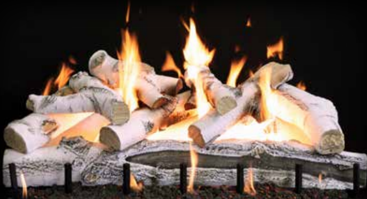
2-Burner Quaking Aspen 36"