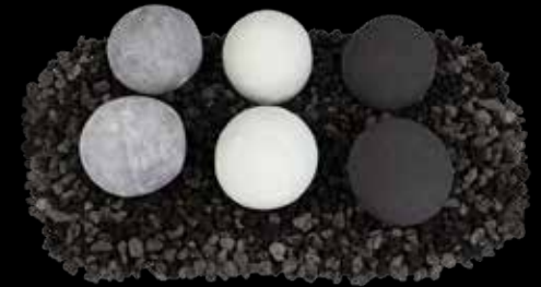
4" Cannonballs - Gray - White - Black