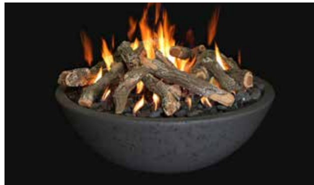
AZ Weathered Oak Log Set w/Lava Rock* (Shown in Charcoal)