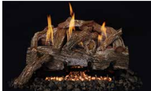
24" Red Oak Gas Logs