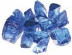
Poseidon Blue Item # RFG-10-PB

1/2" Reflective Glass is sold in 10 pound clear plastic containers. Athena glass is designed for use in fire-pits and other fire features. When the glass is in a fire-pit or fire feature - Do not touch the glass as it is hot and will cause 3rd degree burns. Keep away from children.