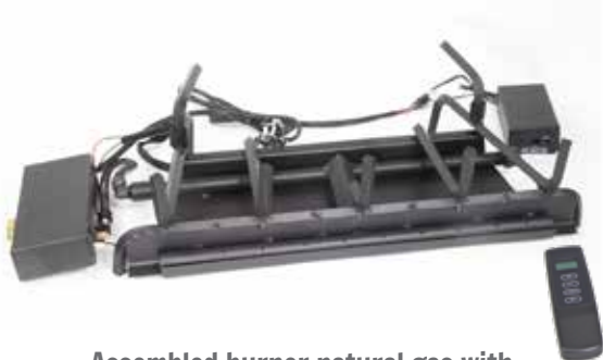
Assembled burner natural gas with battery electronic and remote system. 2BRN-##-***-MVKEI-GCRK