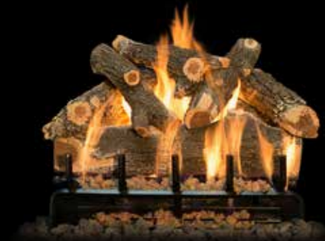
3-Burner Arizona Weathered Oak 24"