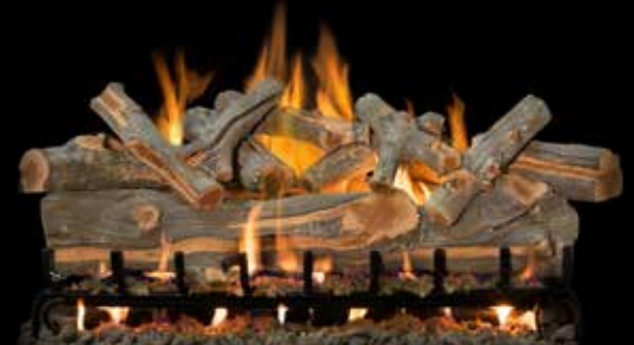
3-Burner Arizona Juniper 42"