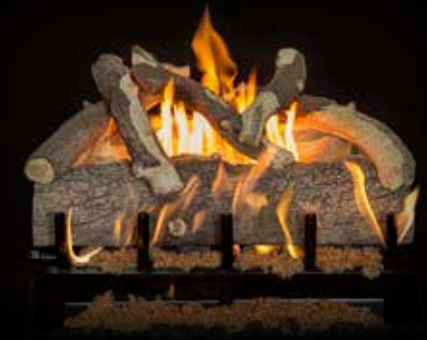
3-Burner Blue Pine Split 24"