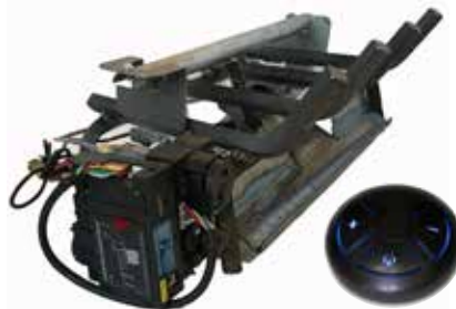
IPI Electric with Burner Puck Remote included with this Variable Electric model only.