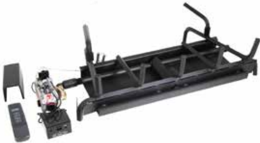
Assembled burner natural gas with millivolt and remote system. 2BRN-##-***-MVK-GCRK