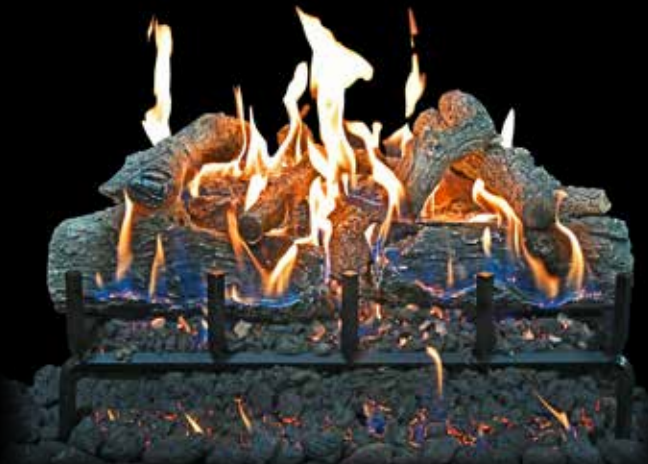
Lava Burner Series - GlowFire™ Logs AZ Weathered Oak Charred 24"