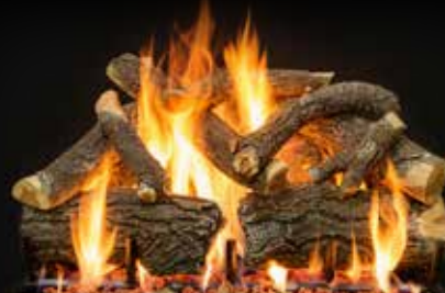
2-Burner Arizona Weathered Oak Charred 30"