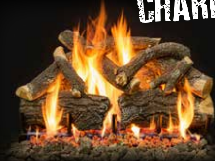
Shown: Arizona Weathered Oak Charred 30"