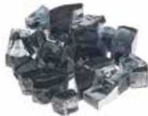
Vesper Black Item- RFG-10-VB