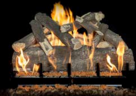
Shown: Blue Pine Split 30"