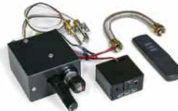
120K (NG & LP) BTU Rating Item # MMVKR-LP or MMVKR-NG