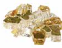
Amber Diamond Item # RFG-10-AG