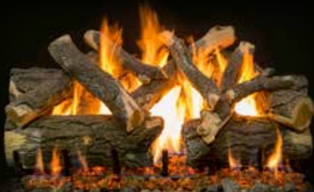
3-Burner Arizona Weathered Oak Charred 36"