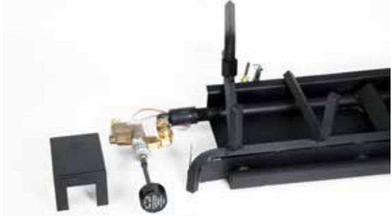
Assembled burner natural gas with safety pilot system. 2BRN-##-***-SP