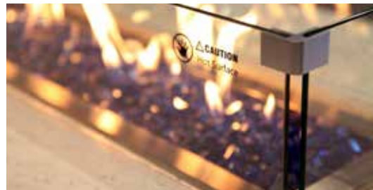
Optional - Glass Flame Windguard