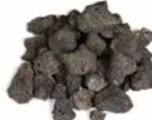
Lava Rock Available in 10 lb. Bags Item # HP-B-R-10