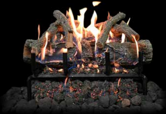
Lava Burner Series - GlowFire™ Logs AZ Weathered Oak Charred 18"