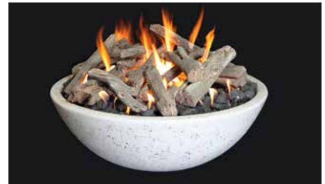
Western Driftwood Log Set w/Lava Rock* (Shown in White)