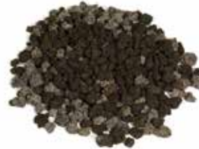
Lava Granules Available in 10 lb. Bags Item- HP-B-GR-10