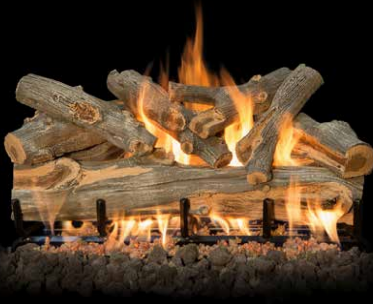
2-Burner Arizona Juniper 30"