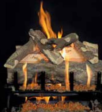
3-Burner Blue Pine Split 18"