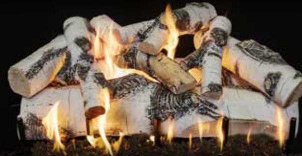
2-Burner Quaking Aspen 30"