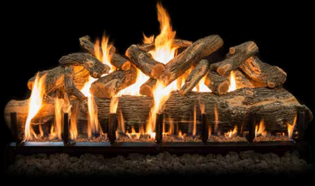
Jumbo-Burner - Jumbo Arizona Weathered Oak 60"