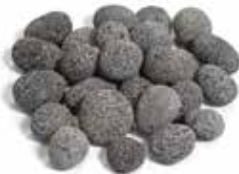
2" - 3" Lava Pebbles Available in 50 lb. Bags Item # NL-5080