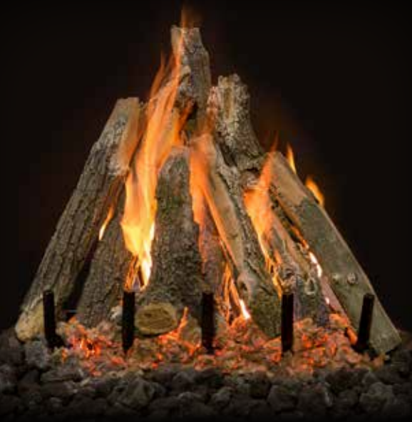
Kiva Arizona Weathered Oak (AWO)