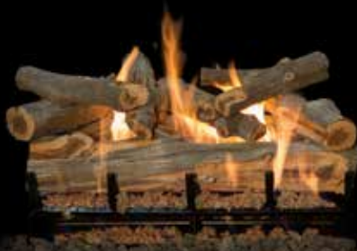
3-Burner Arizona Juniper 30"