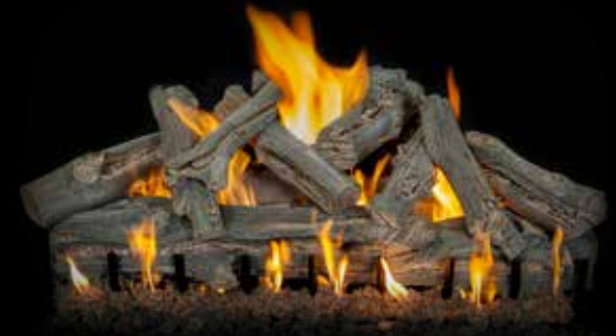
2-Burner Arizona Western Driftwood 42"