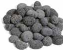
1" - 2" Lava Pebbles Available in 50 lb. Bags Item- NL-3050