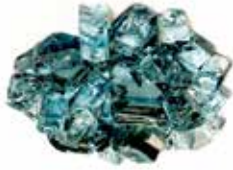
Adriatic Topaz Item # RFG-10-AT