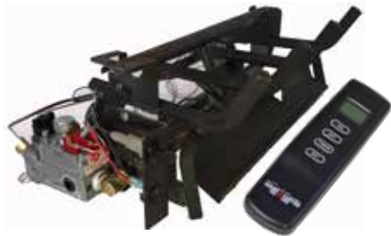
Standard Millivolt with Burner & Remote