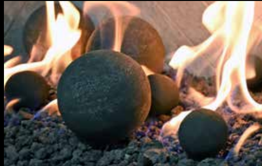
Fireplace Fiber Cannonballs