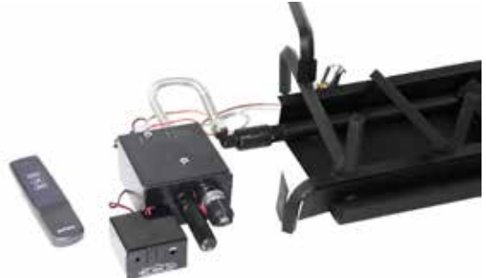
Assembled burner natural gas with modulating millivolt and remote system. 2BRN-##-***-MMVR