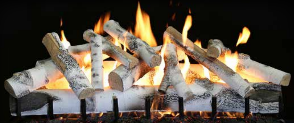
2-Burner Quaking Aspen 42"