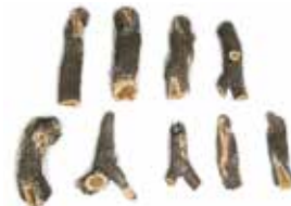
Arizona Weathered Oak Gas Log Set Item- FPAWO-18/24

18" - 24" 9 pcs. Set or 30" - 36" 16 pcs. Set