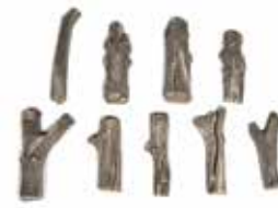
Western Driftwood Gas Log Set Item- FPDW-18/24