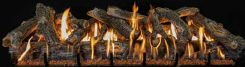
2-Burner Arizona Weathered Oak 60" Also available in 48"