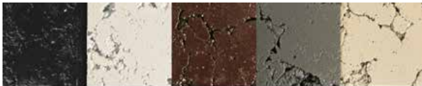
Charcoal White Rust Gray Bone