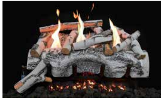
NEW 24" Aspen Birch Gas Logs