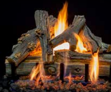
2-Burner Arizona Juniper 21"