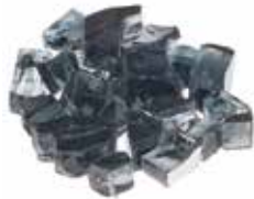
Vesper Black Item # RFG-10-VB