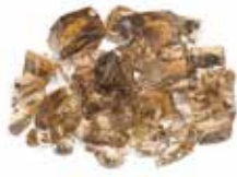
Terra Copper Item- RFG-10-TC