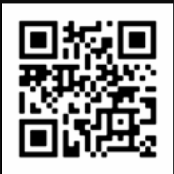
Grand Canyon Gas Log Web Site