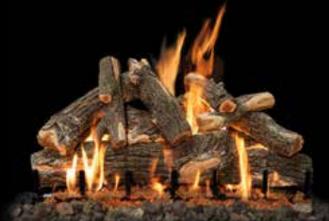
2-Burner Arizona Weathered Oak 36"