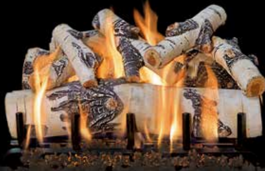
2-Burner Quaking Aspen 24"