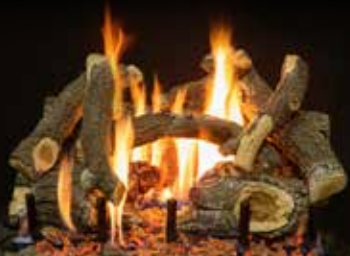
2-Burner Arizona Weathered Oak Charred 24"

Arizona Weathered Oak Charred (AWOC) Available in 18", 24", 30", 36" and 42". Front View and See-Through. Burner compatibility 2 and 3 burner.