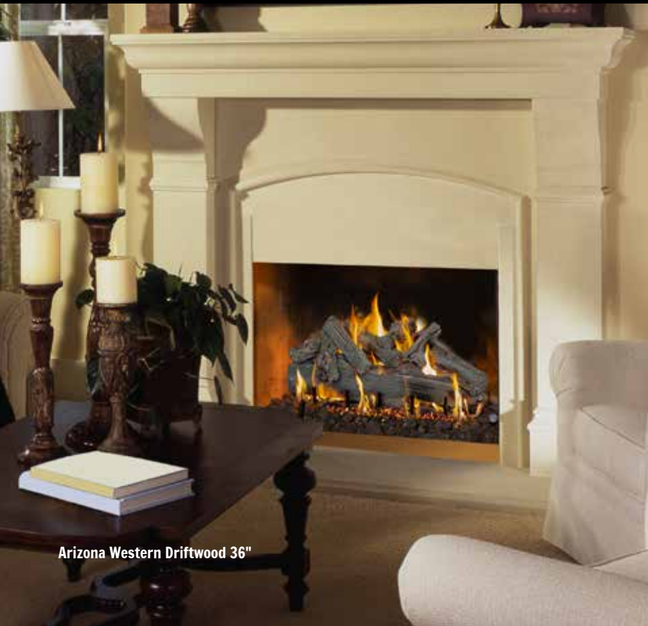
Arizona Western Driftwood 36"