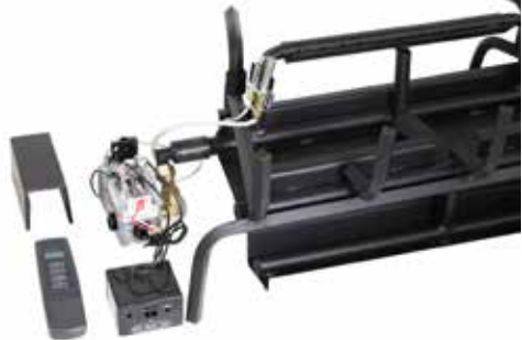
Assembled burner natural gas with millivolt and remote system. 3BRN-##-***-MVK-GCRK