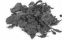
6 oz Bag Item # GLE-6B