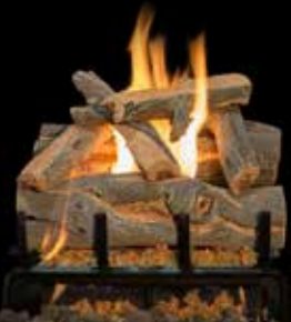
3-Burner Arizona Juniper 18"