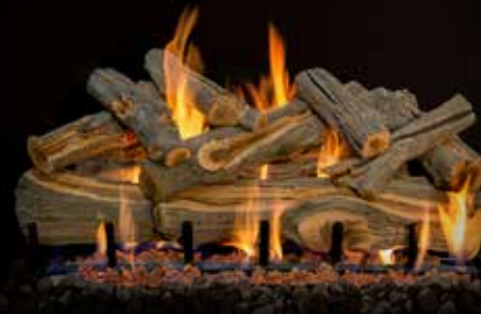
2-Burner Arizona Juniper 36"