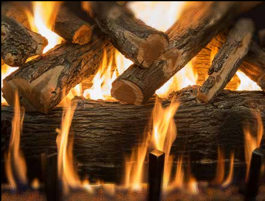
Jumbo-Burner - Jumbo Arizona Weathered Oak 60"