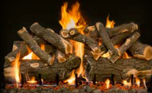
3-Burner Arizona Weathered Oak Charred 42"