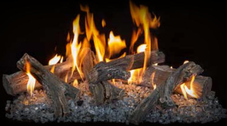
Glass Burner with 24" Driftwood Logs