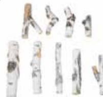
Aspen Birch Gas Log Set Item- FPASP-18/24