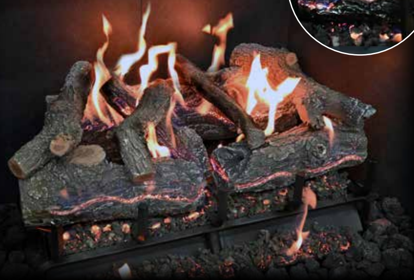
Lava Burner Series - GlowFire™ Logs AZ Weathered Oak Charred 24"