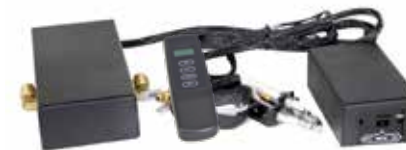
120K Natural Gas BTU Rating 140 K Propane BTU Rating Item # MVKEIKL or MVKEIKN