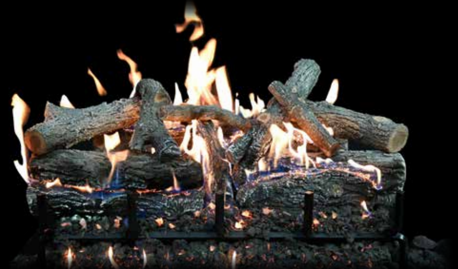
Lava Burner Series - GlowFire™ Logs AZ Weathered Oak Charred 30"