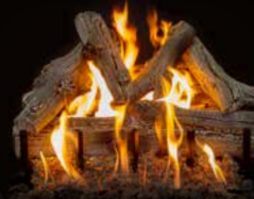
2-Burner Arizona Western Driftwood 21"

Arizona Western Driftwood (WD) Available in 18", 21", 24", 30", 36" and 42". Front View and See-Through. Burner compatibility 2 and 3 burner.