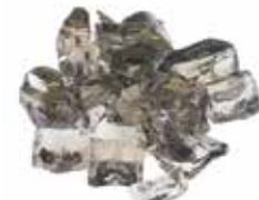
Apollo Bronze Item # RFG-10-AB