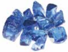
Poseidon Blue Item- RFG-10-PB

1/2" Reflective Glass is sold in 10 pound clear plastic containers. Athena glass is designed for use in fire-pits and other fire features. When the glass is in a fire-pit or fire feature - Do not touch the glass as it is hot and will cause 3rd degree burns. Keep away from children.