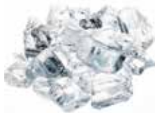
Krystallo Diamond Item- RFG-10-KD