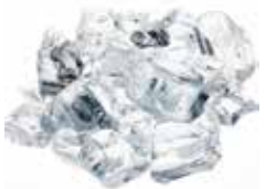
Krystallo Diamond Item # RFG-10-KD