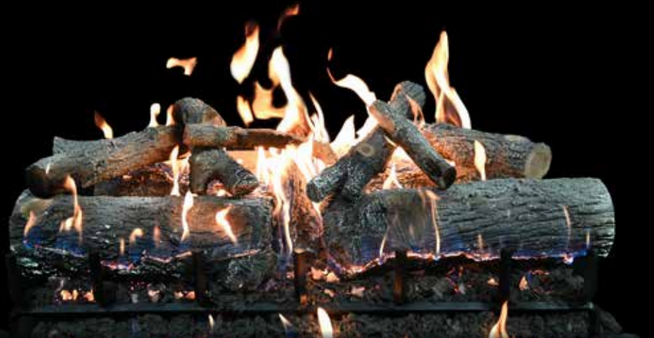
Lava Burner Series - GlowFire™ Logs AZ Weathered Oak Charred 36"