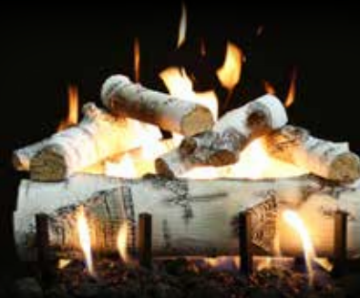
2-Burner Quaking Aspen 18"