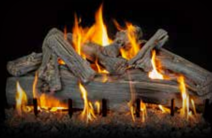
2-Burner Arizona Western Driftwood 36"