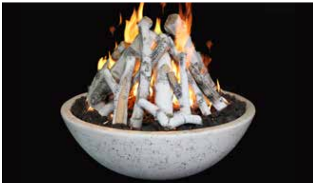
Aspen Tee Pee Log Set w/Lava Rock* (Shown in White)