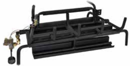
Assembled burner natural gas with safety pilot system. 3BRN-##-***-SP