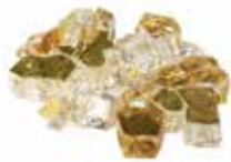
Amber Diamond Item- RFG-10-AG