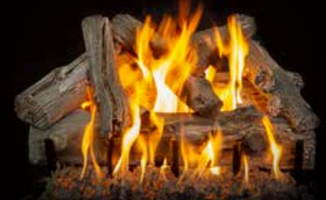
2-Burner Arizona Western Driftwood 24"