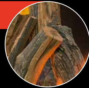
Kiva Arizona Juniper (AJ)