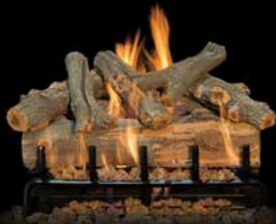
3-Burner Arizona Juniper 24"