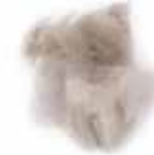
1 Gram Item # PEB-1