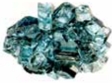
Adriatic Topaz Item- RFG-10-AT