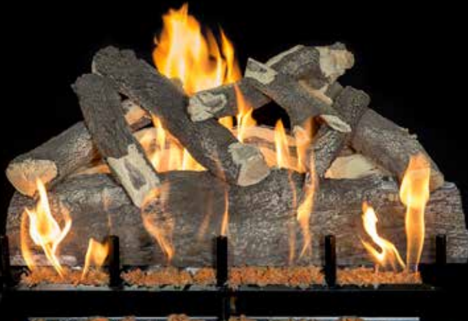
3-Burner Blue Pine Split 30"