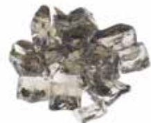
Apollo Bronze Item- RFG-10-AB