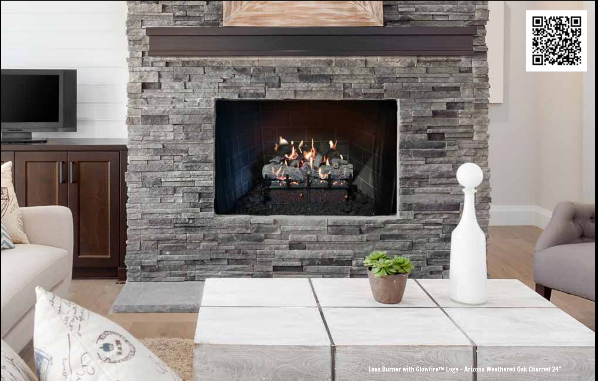
Lava Burner with Glowfire™ Logs - Arizona Weathered Oak Charred 24"