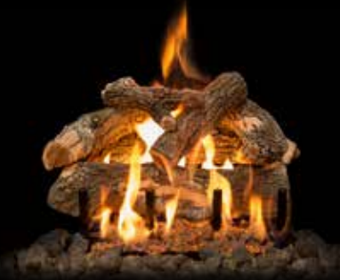
2-Burner Arizona Weathered Oak 18"

Arizona Weathered Oak (AWO) Available in 18", 21", 24", 30", 36", 42", 48" and 60". Front View and See-Through. Burner compatibility 2 and 3 burner.