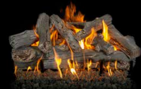
Shown: Western Driftwood 30"