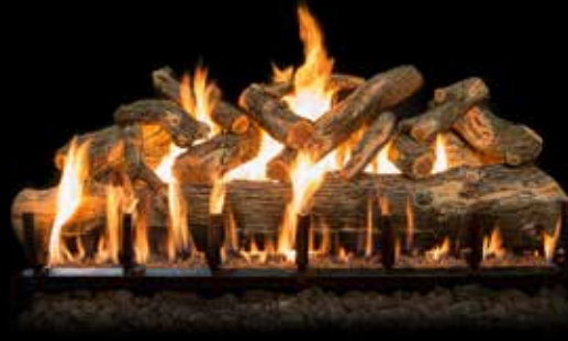
Shown: Jumbo Arizona Weathered Oak 48"