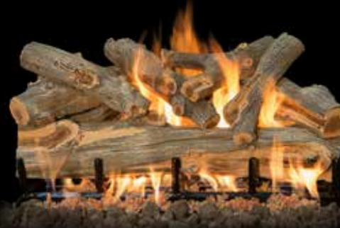
Shown: Arizona Juniper 30"