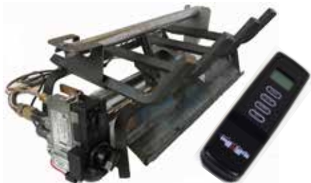
Variable Control with Burner & Remote