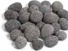
2" - 3" Lava Pebbles Available in 50 lb. Bags Item- NL-5080