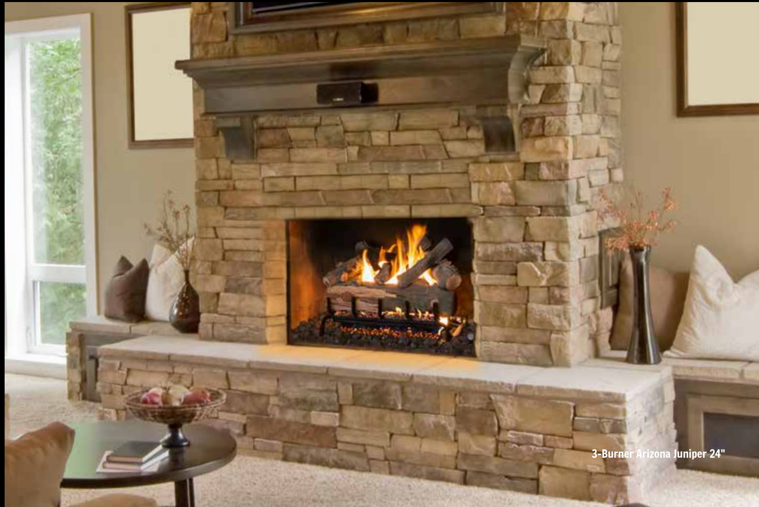
3-Burner Arizona Juniper 24"