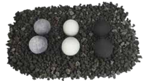
2" Cannon Balls Box of 12 Black, Dark Gray or Silver Item- CB2-12-##