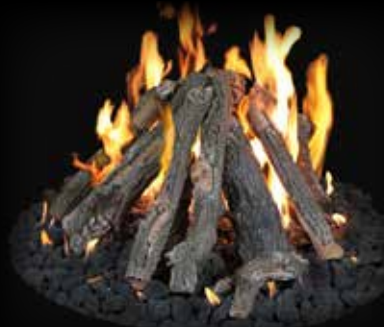
Shown: Tee Pee Stack AW0 30/36"