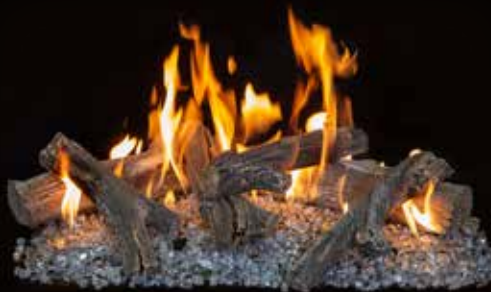
Shown: Linear Western Driftwood 24"