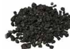
6 oz Bag Item # VEM-6