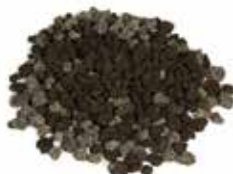
Lava Granules Available in 10 lb. Bags Item # HP-B-GR-10