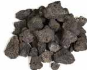
Lava Rock Available in 10 lb. Bags Item- HP-B-R-10