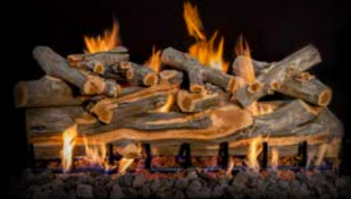
2-Burner Arizona Juniper 42"