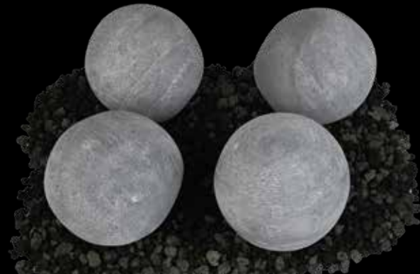
6" Cannonballs - Gray shown