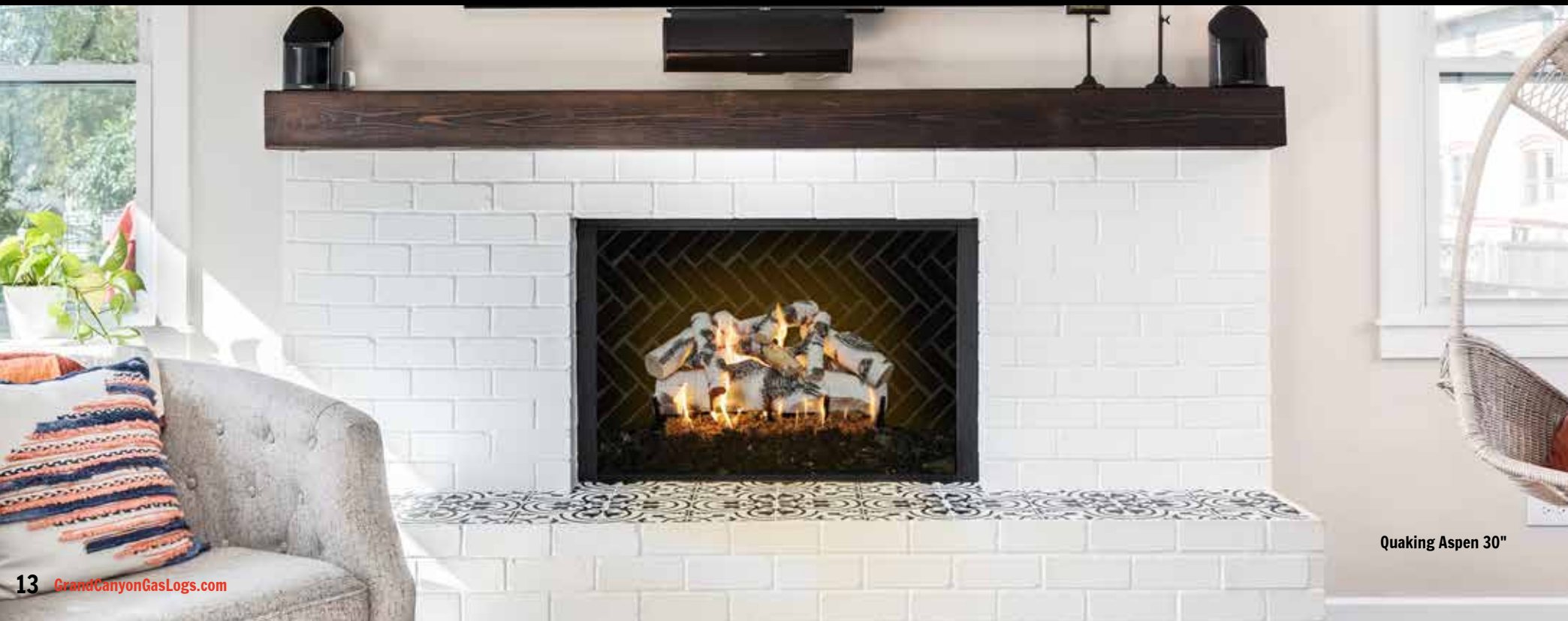
Quaking Aspen 30"