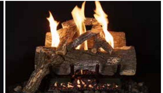
18" Weathered Oak Gas Logs