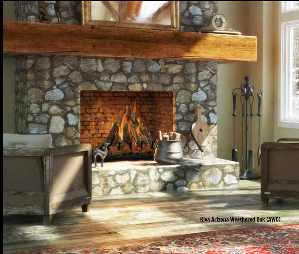
Kiva Arizona Weathered Oak (AWO)